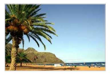
Tenerife, Canary Islands